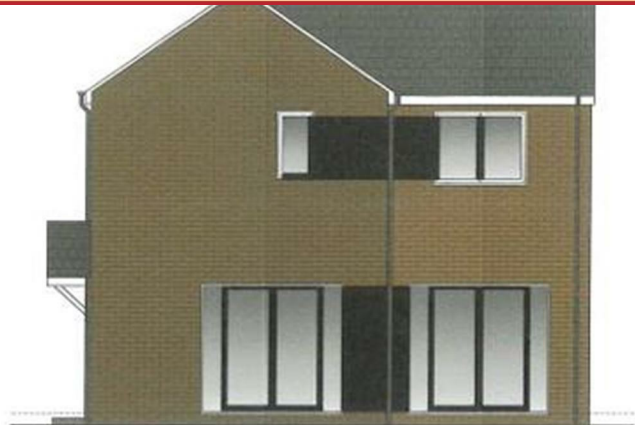
PROPOSED SIDE (SOUTH) ELEVATION