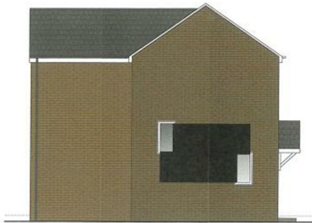
PROPOSED SIDE (NORTH) ELEVATION