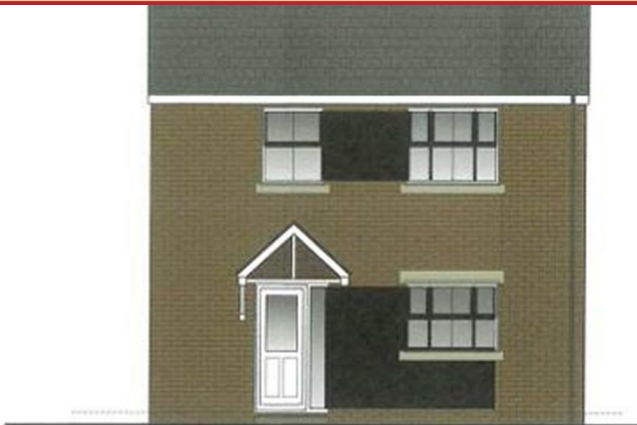
PROPOSED FRONT (EAST) ELEVATION